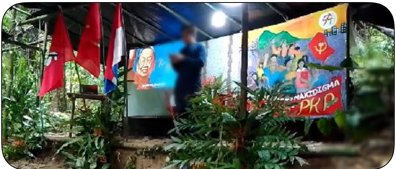
Comrades from Bicol hold a program to give tribute to Ka Joma

Up to the early 2000s, he also played a lead role in the formation of the International Conference of Marxist-Leninist Parties and Organizations (ICMLPO) which serves as a center for ideological and practical exchange among